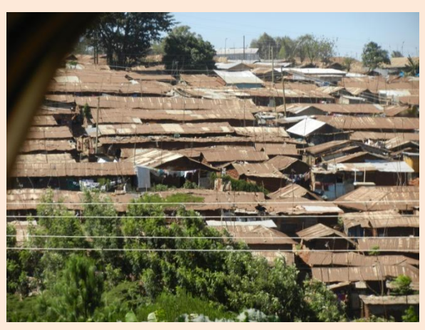
Kibera, where Nelson supports two girls

to 1.7 million Kenyans. No running water, few people have electricity, sewage and garbage everywhere, but the people do the best they can and look after one another. We learned very quickly that getting an education is the only way Kenyans have to raise themselves above a simple existence and make a better life for themselves and their families. Free education ceases at Grade 8 in Kenya and without the means to pay for high school, Kenyans will most likely live a life of poverty and survival.