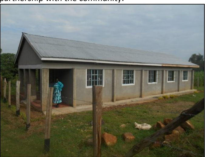
Above: Boys' Dormitory at Mwikhomo School for the Deaf where the new beds (below) will be placed

At Mwikhomo School GC4C provided new beds for the boys' dormitory, and at Kimangeti Girls School, a new water supply has been installed in partnership with the community.