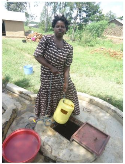
Well funded by Nelson in Nambale

[Nelson's story continued] have also constructed a well in my village so my community can have access to clean water. I provide children with food and clothing, and have almost completed construction of a home for my elderly parents who have not had decent shelter, food or clothing.