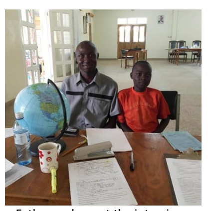
Father and son at the interview.