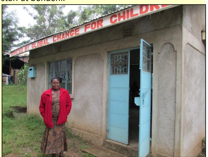
Principal and the new Bondeni kitchen in 2013

Sarah and I immediately excused ourselves from the table and ran to the local supermarket and bought 30 ice cream cups for the staff. When we gave out the desserts to the teachers, the look on their faces was priceless. They laughed and thoroughly enjoyed their unexpected treat. Who would have thought a little sarcastic comment could make 28 teachers smile and enjoy something that they don't have very often? A small thank you to the hard working staff at Bondeni.