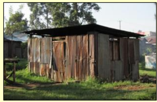
Former Bondeni kitchen (Continued over)

GC4C provided the funding for the new kitchen and KEEF managed the project to ensure the end result was an efficient and functional kitchen for the school. The old kitchen was small, with no ventilation and barely able to serve the school population.