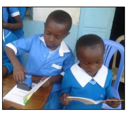
Stamping the books