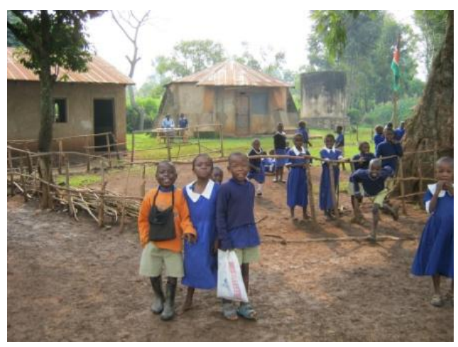
Rosterman Primary School

Global Change for Children (GC4C) is a registered non-profit foundation based in Vancouver. They have generously provided funding for several KEEF projects, including the Bondeni Primary School library, and the KEEF workshops. This year they provided funds for furniture at Rosterman Primary School.