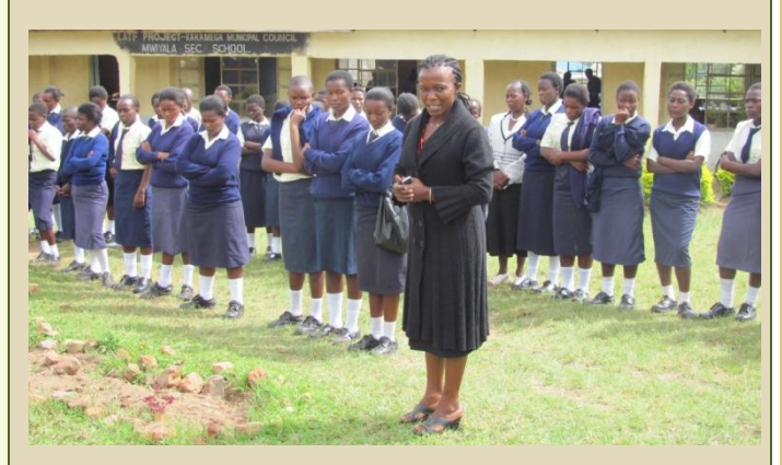
The deputy principal thanks GC4C for financing the construction of the new Mwiyala classroom.