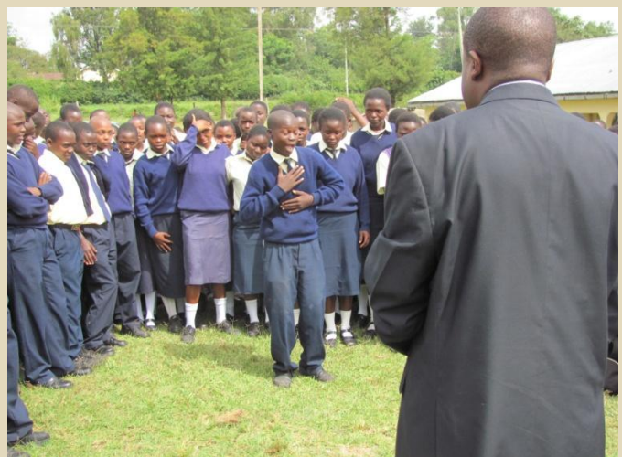
A student recites a poem thanking all those who participated in the construction of the new classroom.