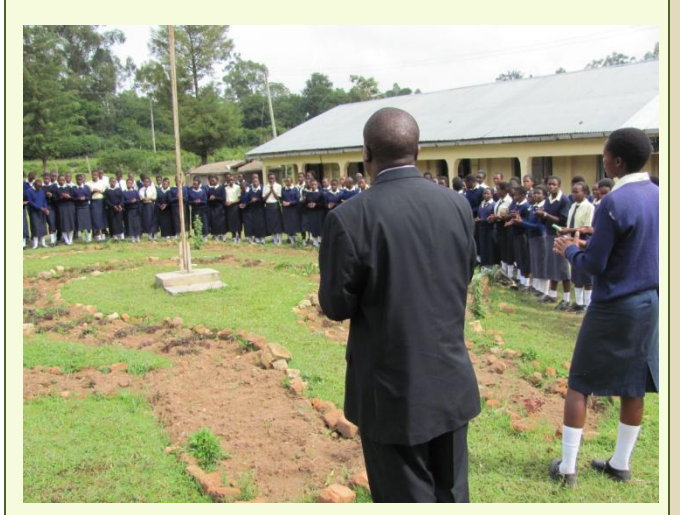
Students are gathered on the parade ground to hear a few words from the guests and so they can thank the representatives of the donors.