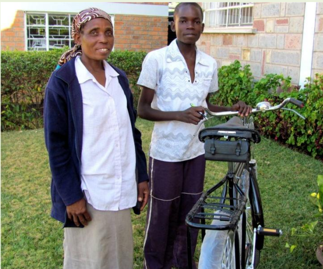
A new bicycle