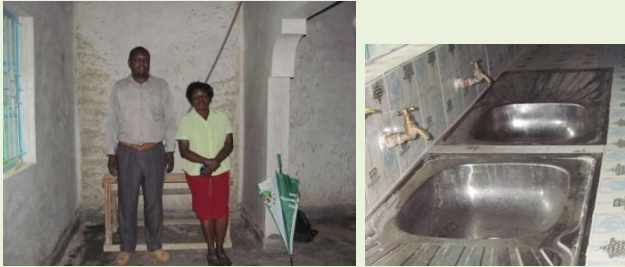
Principal of Bondeni Primary School at right in new facility