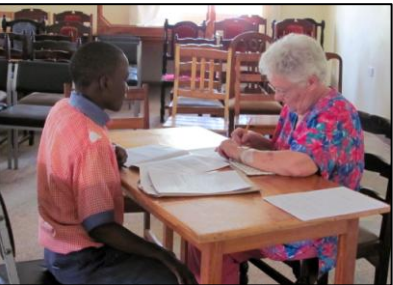
www.kenyaeducation.org KEEF Newsletter November 2013