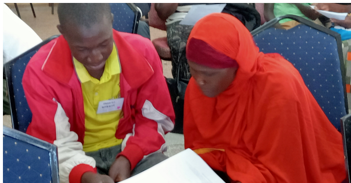
A scholarship student reviews the KEEF contract with his grandmother