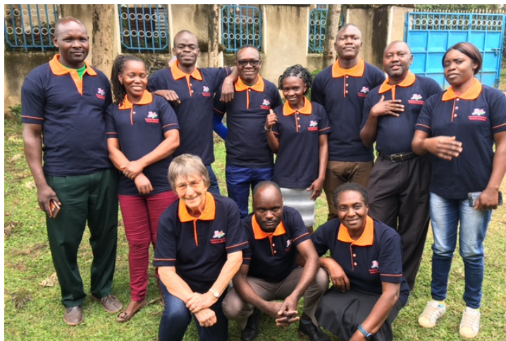
KEEF facilitators Leadership Workshops