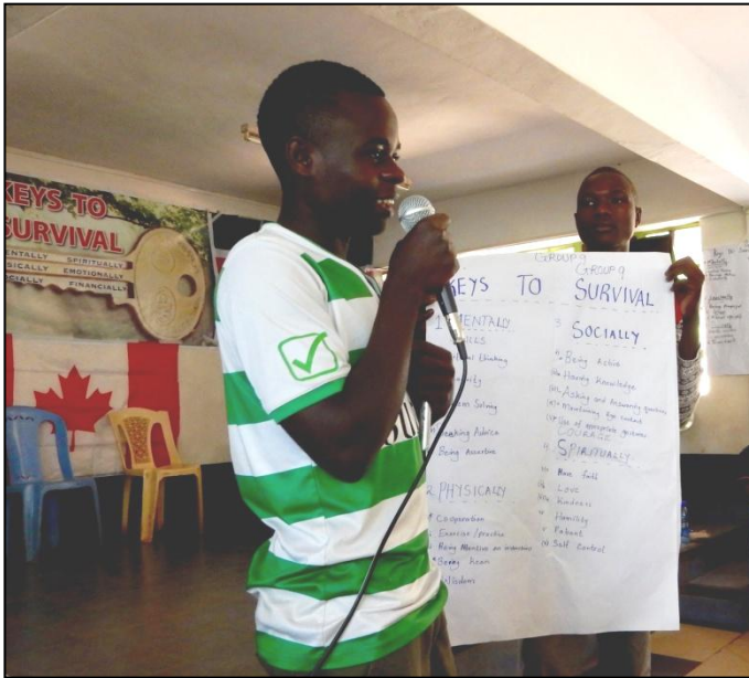
Photo Gallery – Workshops 2018 The theme of the November Life Skills Workshops was “Keys to Survival”