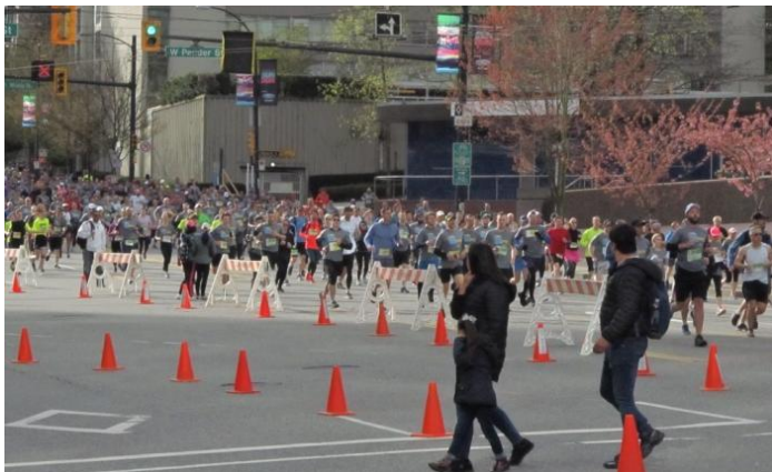
Over 40,000 runners on Georgia Street