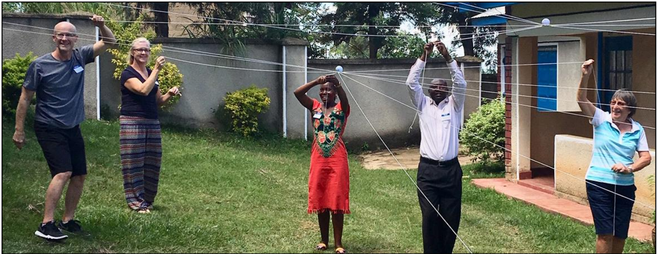
Above: Cooperative activity - The golf ball shuffle Below: Managing conflict planning session