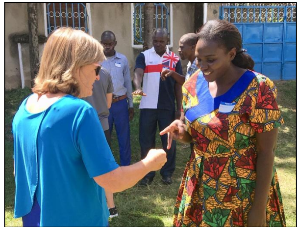
Above – Rock, scissors, paper