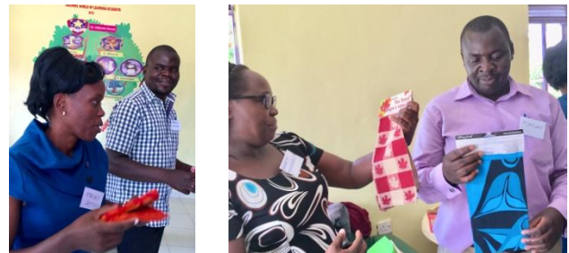
Choosing the presents