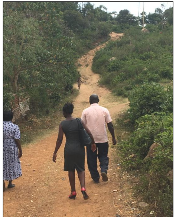
Visiting Emasera school