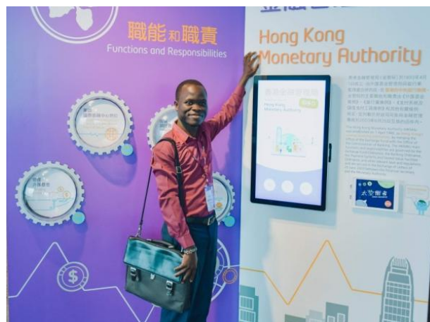
Above: Hong Kong Monetary Authority Below Hong Kong University of Science & Technology

During the trip, we made several industry visits where we learned how to match theory taught in class into practice as we listened to various speakers. We also visited various Universities where we learnt about the graduate and post-graduate programs that they offer.