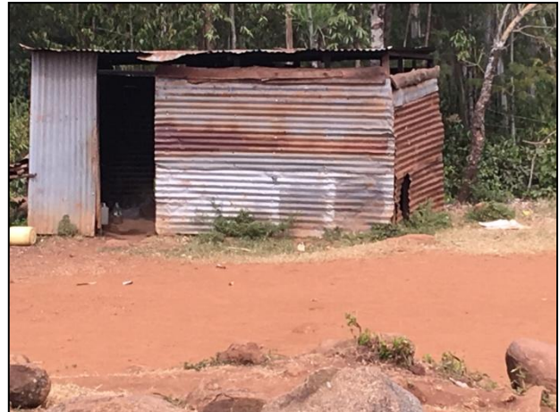
Present day kitchen at Emasera school