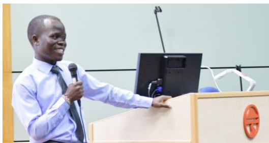
Giving remarks at Lingnan University, HK