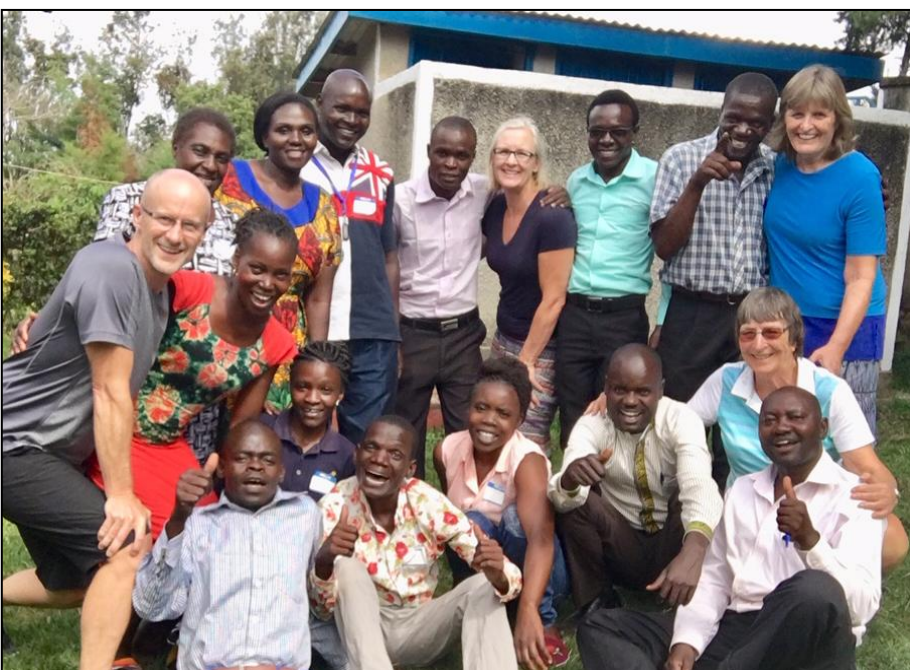
Left – workshop Facilitation Team after just completing the final training session