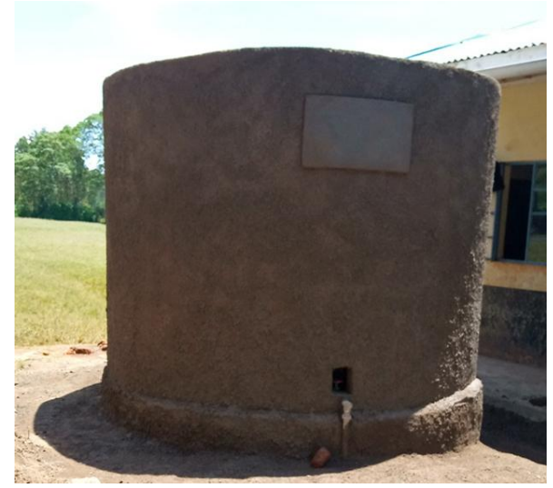
Tank is now protected