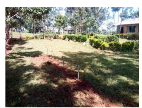
Tap stands completed