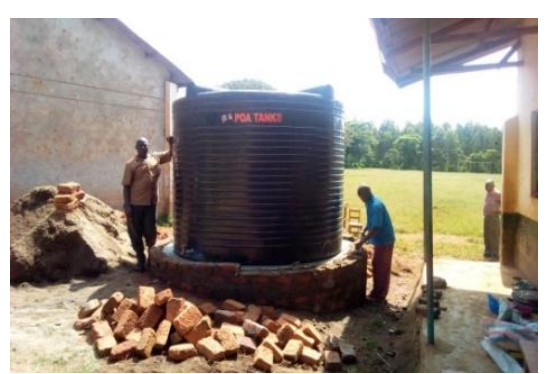
Water tank erection at Emulembo primary