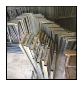
Left: Metal frames for making desks for Shisele Primary School