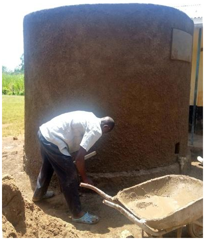
Fundi doing roughcasting on the tank