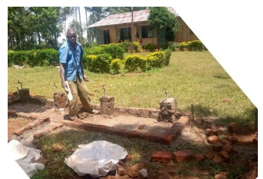
Erection of tap stands where pupils will be washing hands