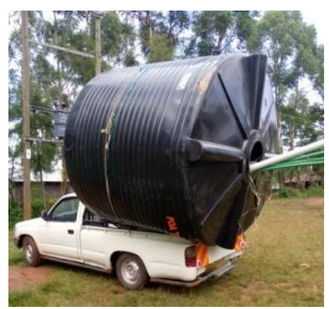
Emulembo Primary - water tank delivery

The photos below reflect the many steps that must be undertaken to complete a water harvesting project. KEEF and GC4C have completed several similar water projects over the past decade.